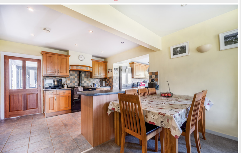
Open Plan Kitchen/Living Room