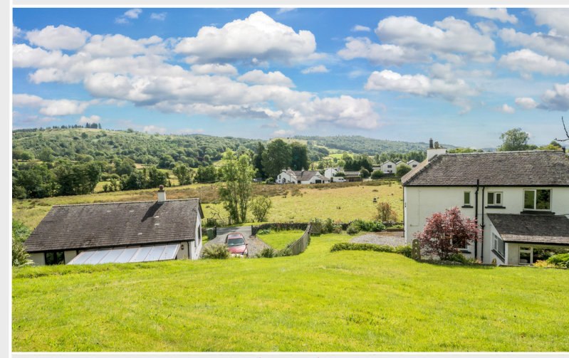
Garden and View