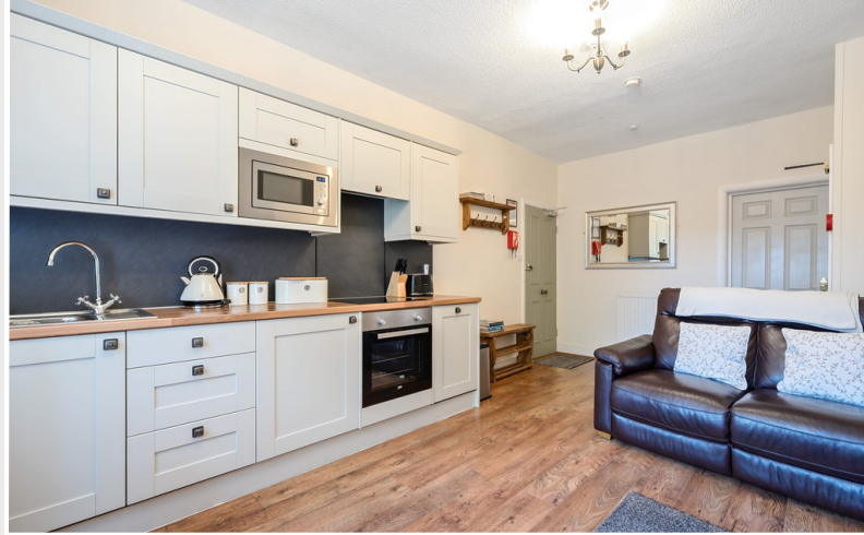
Open Plan Kitchen/ Sitting Area

Anti-Money Laundering Regulations (AML) Please note that when an offer is accepted on a property, we must follow government legislation and carry out identification checks on all buyers under the Anti-Money Laundering Regulations (AML). We use a specialist third-party company to carry out these checks at a charge of £42.67 (inc. VAT) per individual or £36.19 (incl. vat) per individual, if more than one person is involved in the purchase (provided all individuals pay in one transaction). The charge is non-refundable, and you will be unable to proceed with the purchase of the property until these checks have been completed. In the event the property is being purchased in the name of a company, the charge will be £120 (incl. vat).