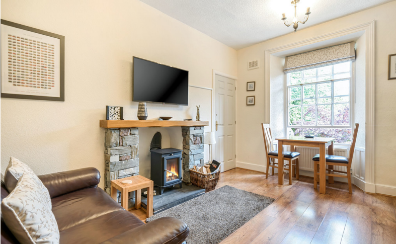
Sitting/ Dining Area