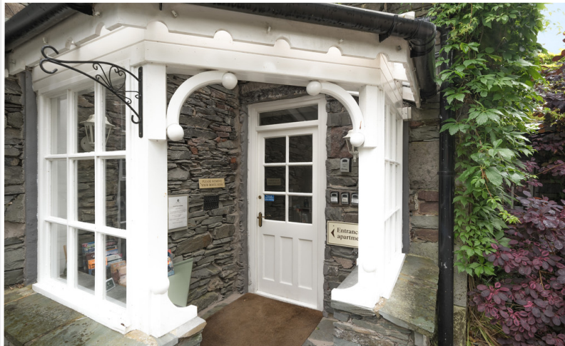
Beck Allans Entrance Porch