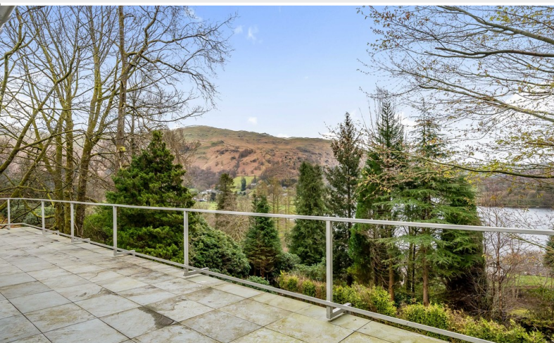
Balcony with Fell and Lake View