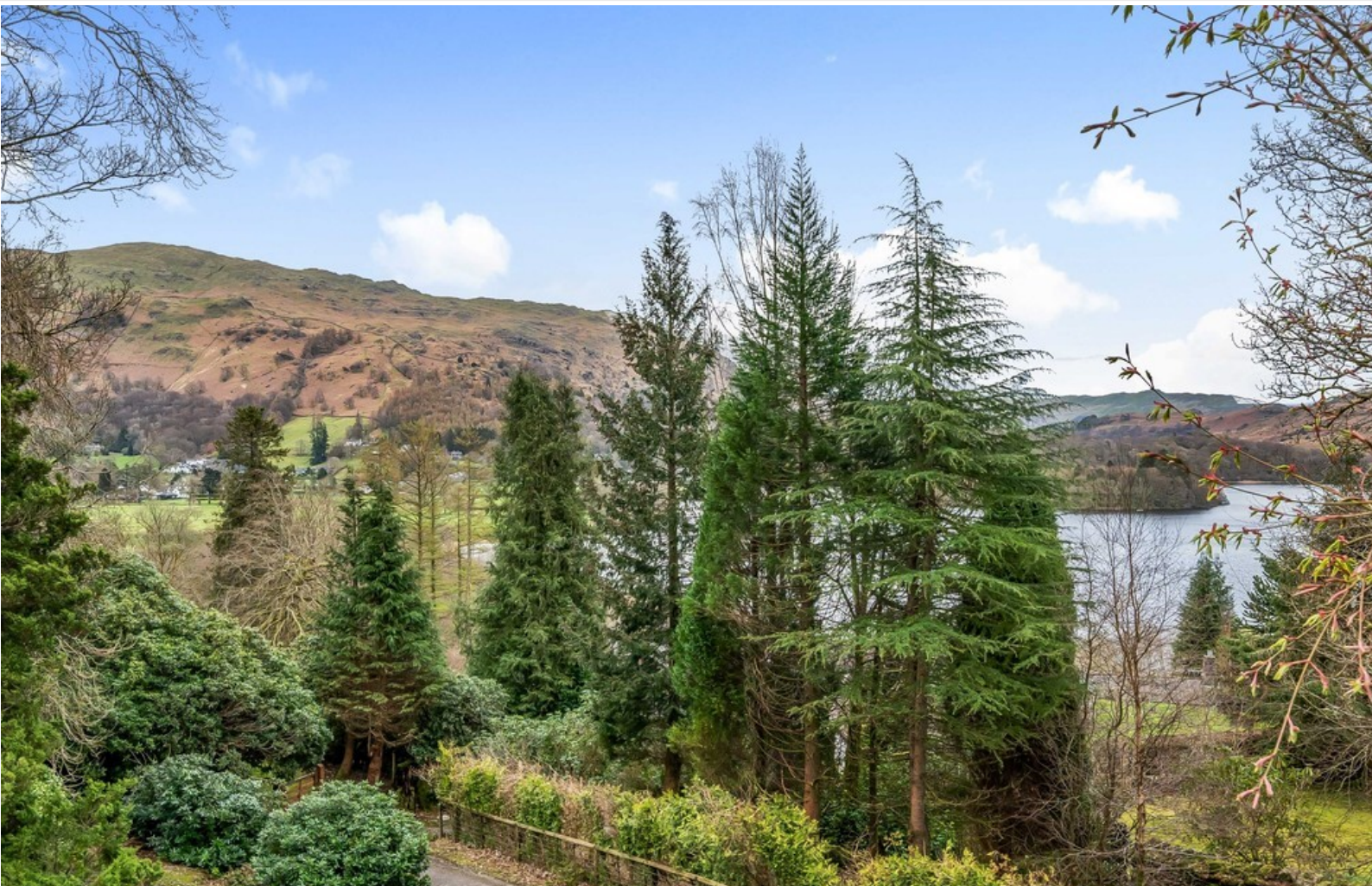
Fell and Lake View

Request a Viewing Online or Call 015394 32800