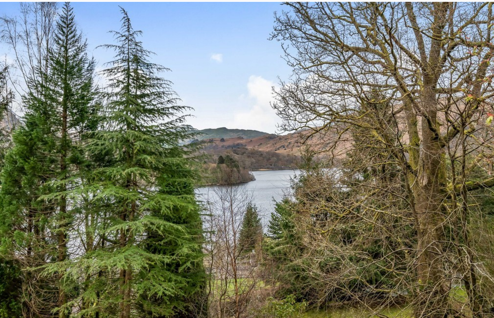
Fell and Lake View