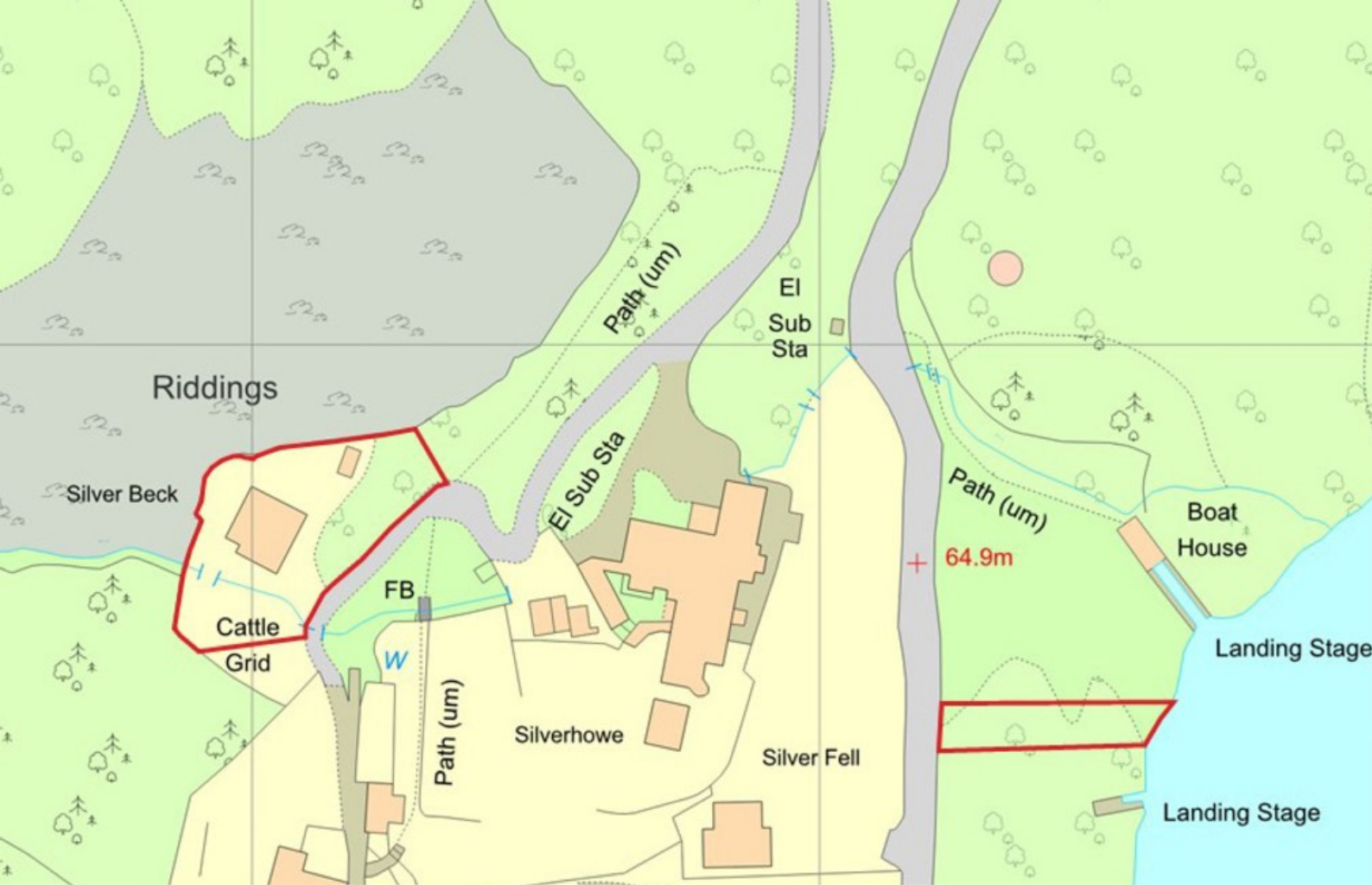
OS Map ref 1158849