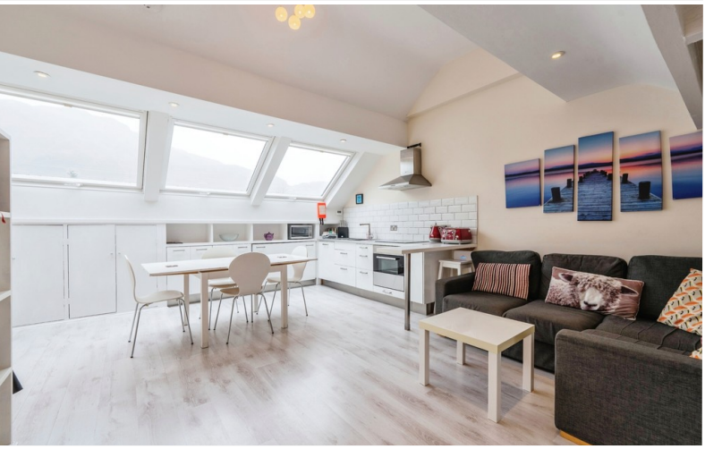
Open Plan Living Space