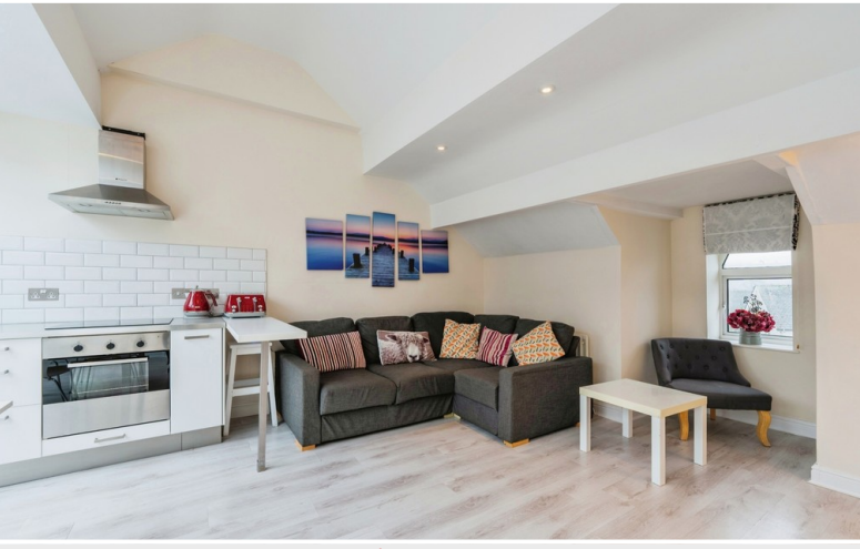
Open Plan Living Space