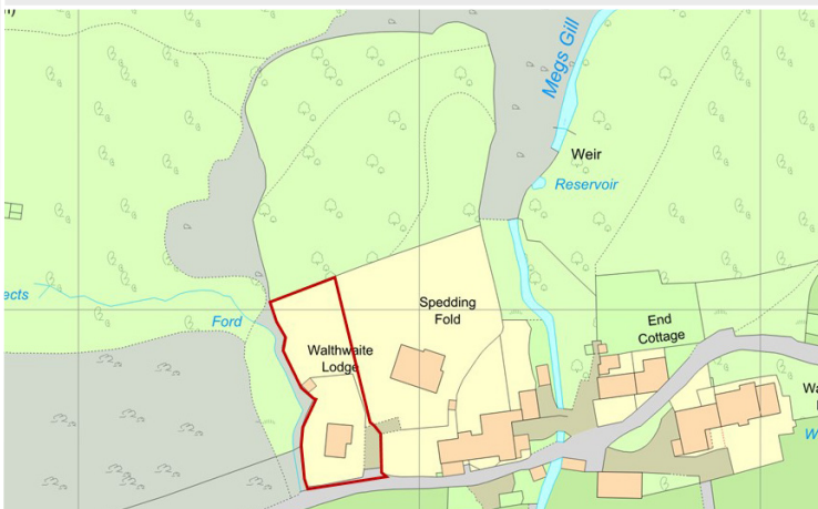
OS Map Ref 01153621