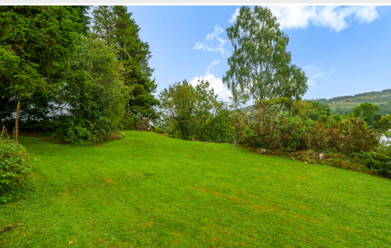
Communal Grounds and View