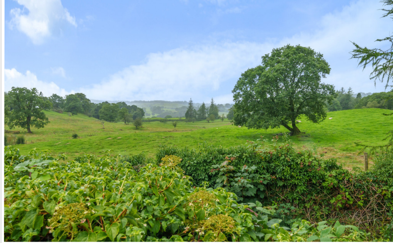
Communal Garden and View

Anti-Money Laundering Regulations (AML) Please note that when an offer is accepted on a property, we must follow government legislation and carry out identification checks on all buyers under the Anti-Money Laundering Regulations (AML). We use a specialist third-party company to carry out these checks at a charge of £42.67 (inc. VAT) per individual or £36.19 (incl. vat) per individual, if more than one person is involved in the purchase (provided all individuals pay in one transaction). The charge is non-refundable, and you will be unable to proceed with the purchase of the property until these checks have been completed. In the event the property is being purchased in the name of a company, the charge will be £120 (incl. vat).