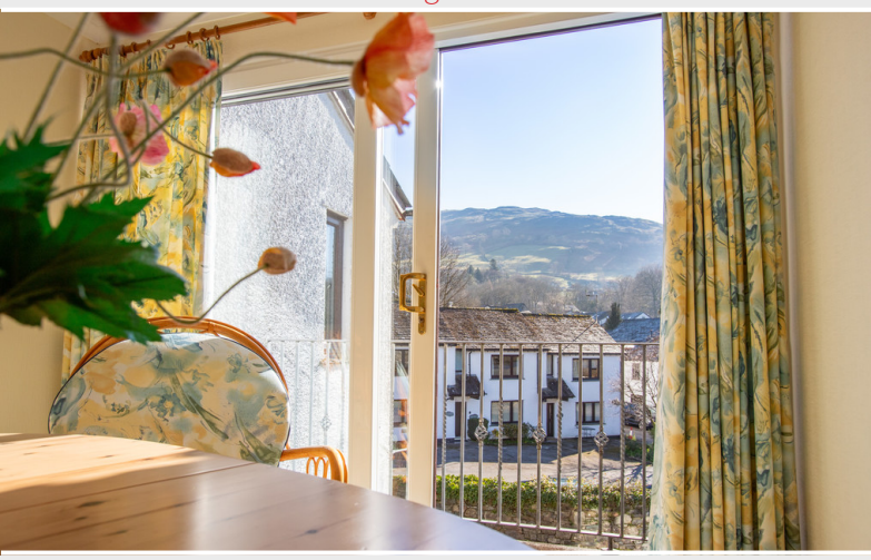
Dining Room View