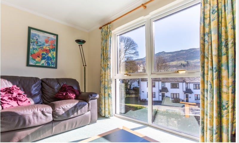
Sitting Room View