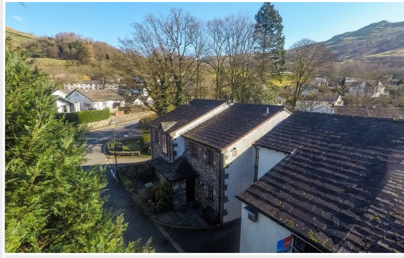
2 Kirkstone Court