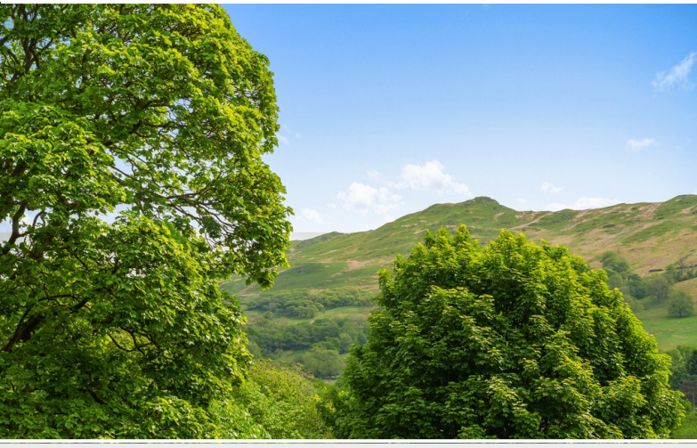
View from Property

Location From the centre of Ambleside proceed north towards Rydal and turn right at the mini roundabout onto the Kirkstone road. Continue a short distance on this road and turning right at Kirkstone Foot Apartments. Kirkstone Court is situated adjacent to the Kirkstone Foot Apartments, at the head of Chapel Hill, and has a pleasant south easterly aspect over Wansfell. There is a very pretty short cut alternative on foot more directly into the village centre via Peggy Hill.