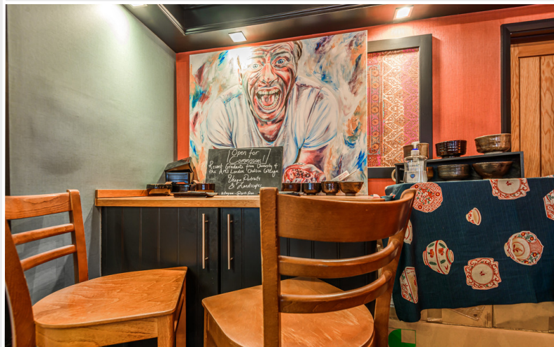
Seating Area 2