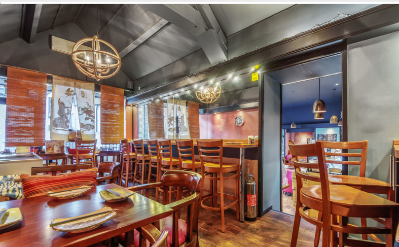
Seating Area 2