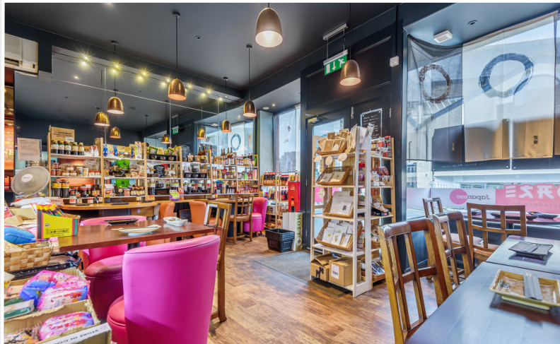
Seating Area 1