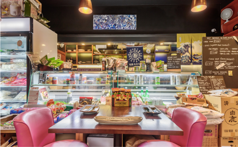
Seating Area 1