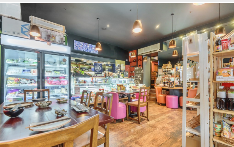
Seating Area 1

Description These superbly placed premises are offered by way of an assignment of a lease extended until August 2028 at a rental of £14,000 pa. Currently operating as a restaurant, take-away and deli, the premises will suit a variety of occupiers and currently specialises very successfully in Japanese cuisine. Previously a wine bar, and a retail shop prior to that, the double fronted 75.45 Sq M of space enjoys excellent road frontage.