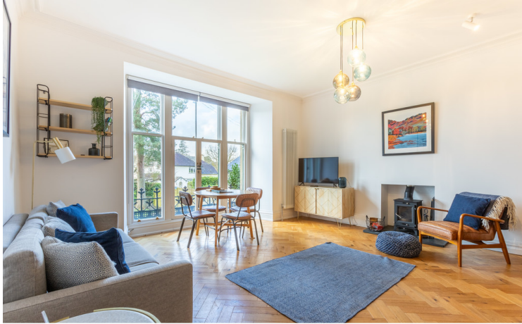
Open plan living room/kitchen