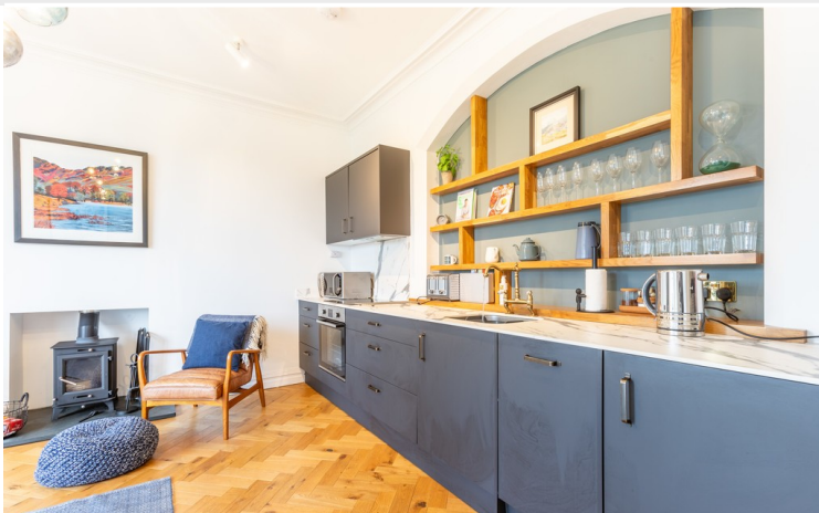
Open plan living room/kitchen

Description: An immaculately presented and spacious 2 bedroomed ground floor apartment in a fantastic location being only a few minutes level walk into Windermere yet tucked away in a quiet location. The property benefits from a designated off road parking space and well maintained communal gardens. This property is an ideal weekend retreat, holiday let or indeed a low maintenance home.