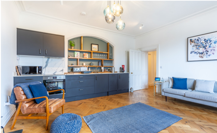
Open plan living room/kitchen