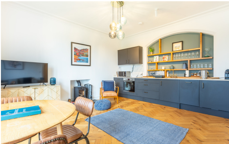
Open plan living room/kitchen