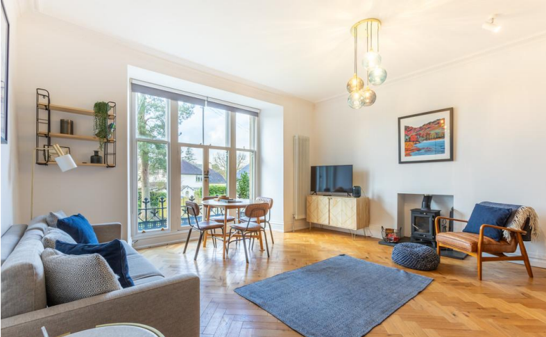
Open plan living room/kitchen