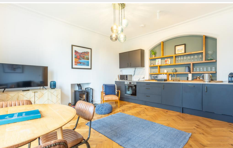
Open plan living room/kitchen