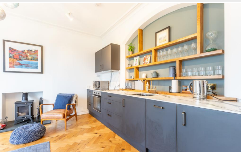
Open plan living room/kitchen

Description: An immaculately presented and spacious 2 bedroomed ground floor apartment in a fantastic location being only a few minutes level walk into Windermere yet tucked away in a quiet location. The property benefits from a designated off road parking space and well maintained communal gardens. This property is an ideal weekend retreat, holiday let or indeed a low maintenance home.