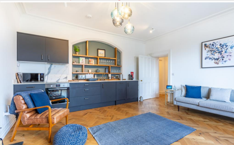
Open plan living room/kitchen