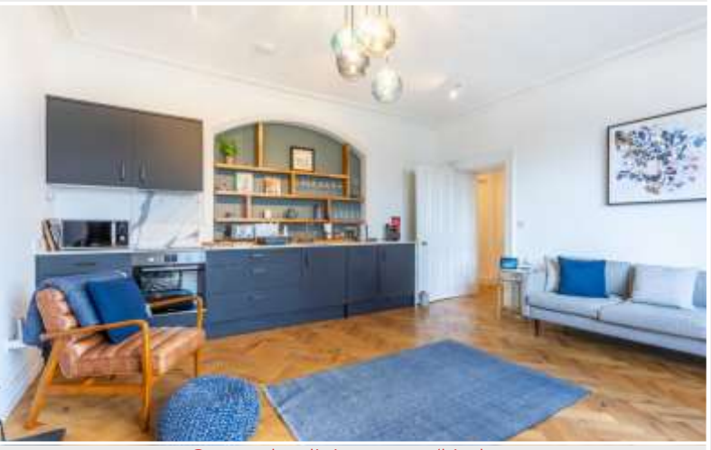
Open plan living room/kitchen