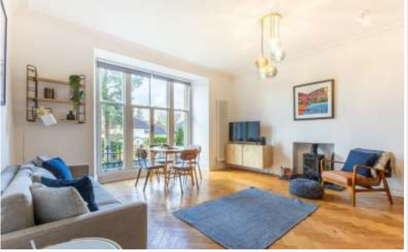
Open plan living room/kitchen