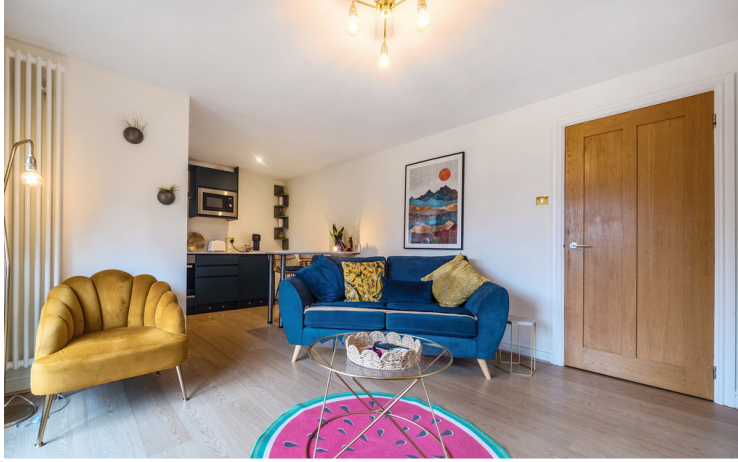
Open Plan living area