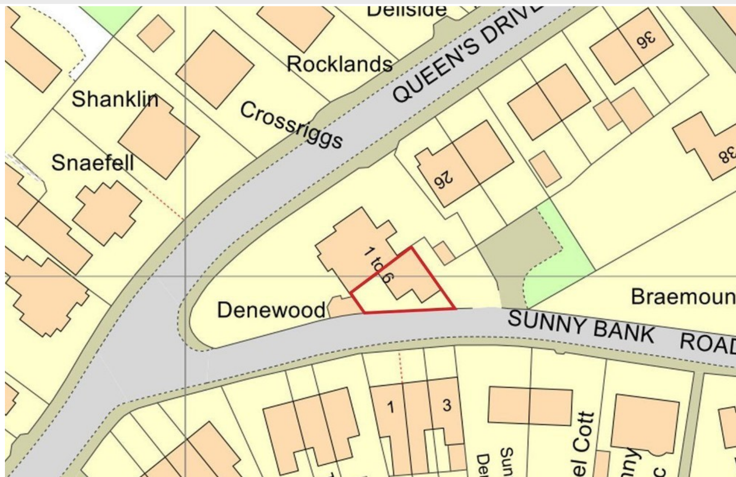
Ordnance Survey Map

Request a Viewing Online or Call 015394 44461