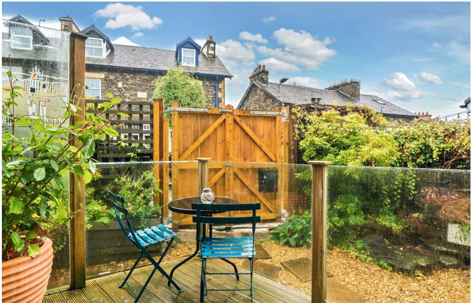
Rear Patio and view