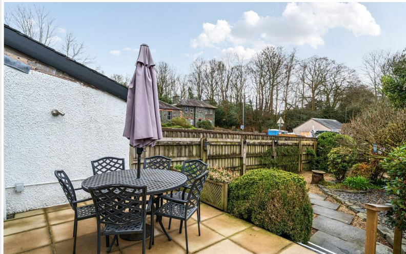
Patio and garden