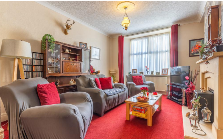
Proposed Dining Room