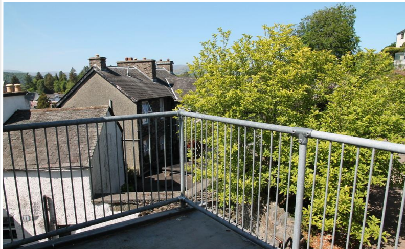
Balcony and View