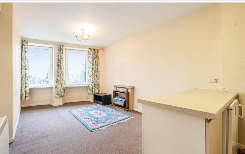
Open plan living room/kitchen