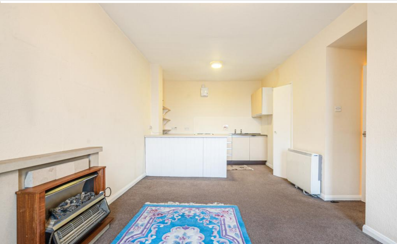
Open plan livnig room/kitchen