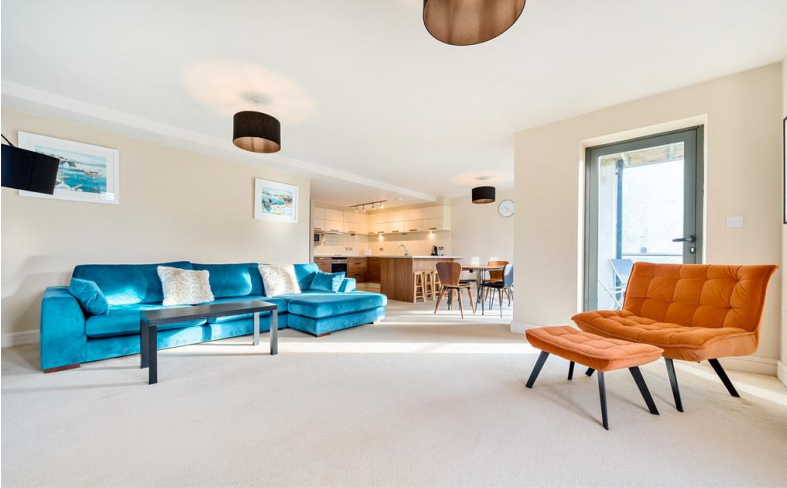
Open Plan Living Room & Kitchen