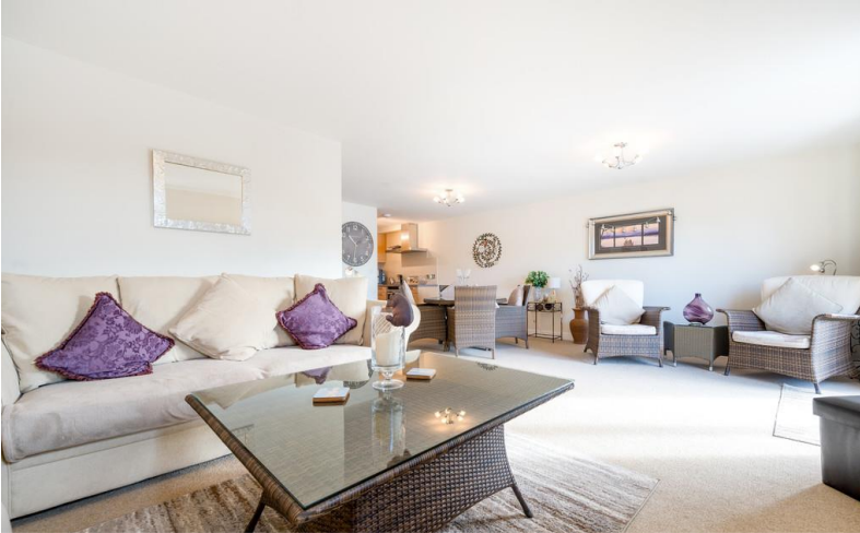
Open plan living room/kitchen