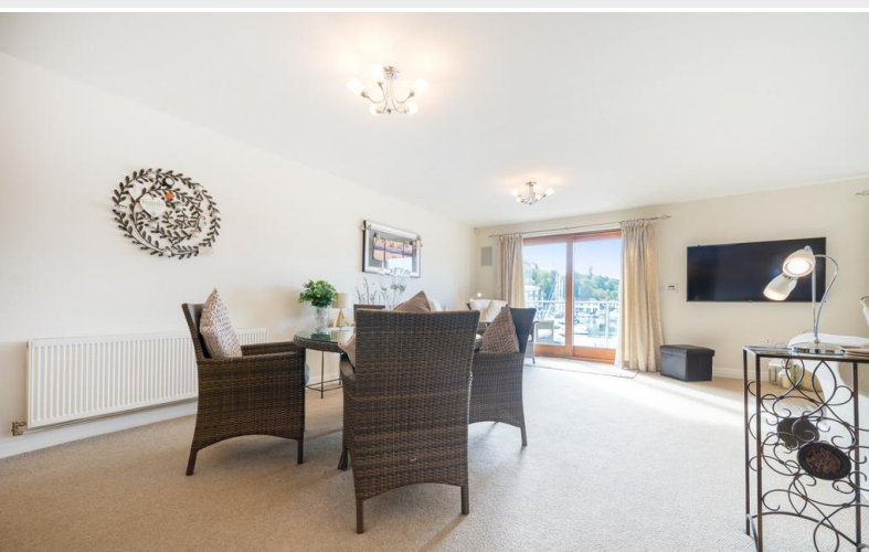
Open plan living room/kitchen