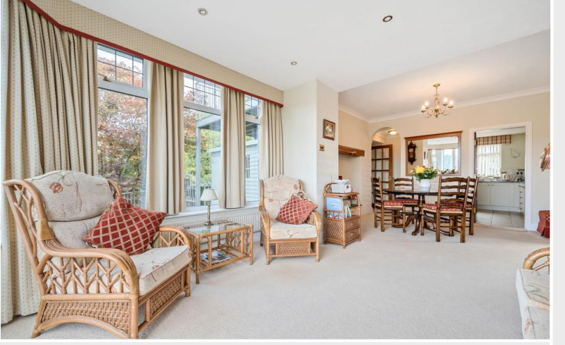
Conservatory and dining area