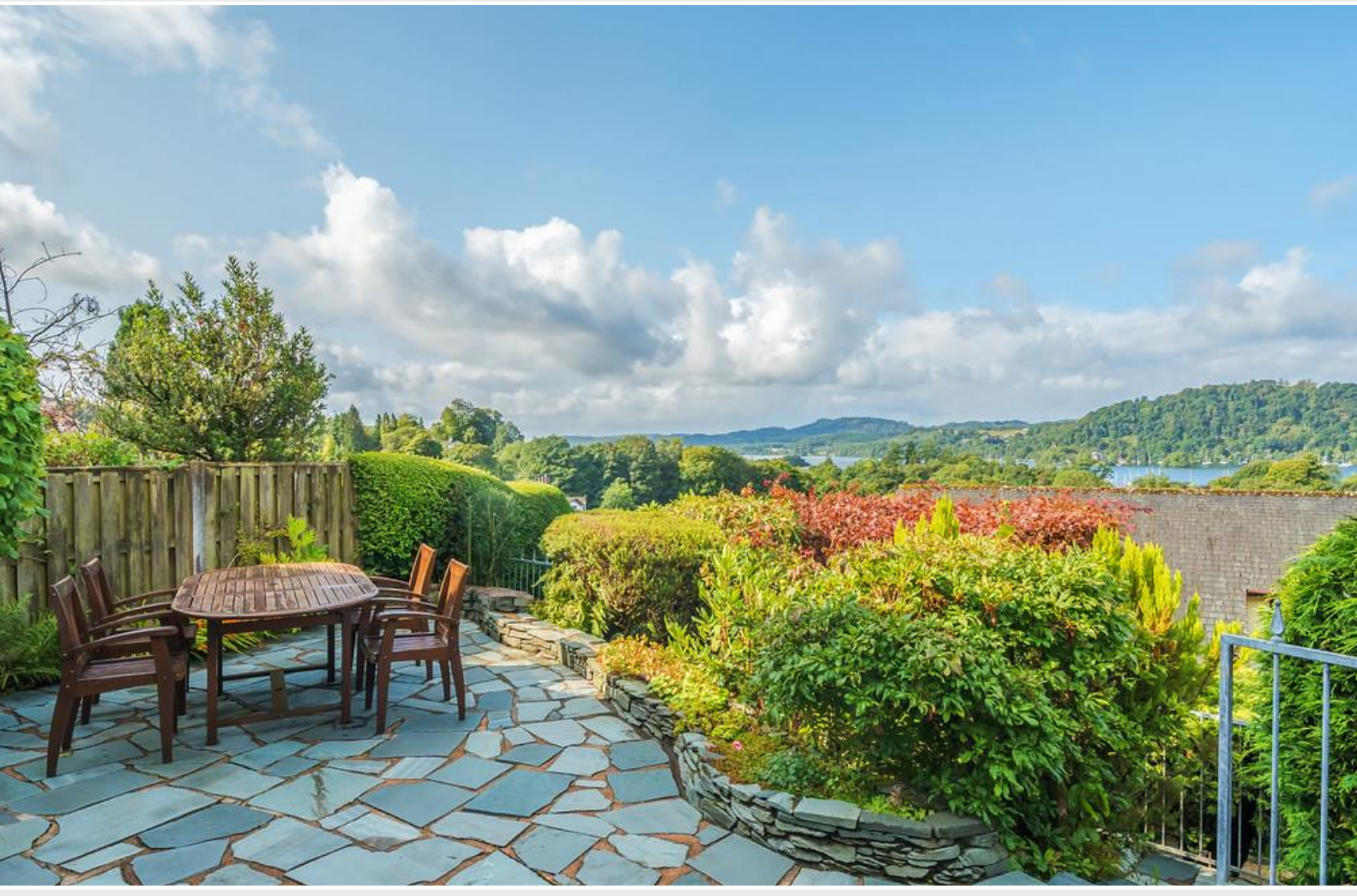
Patio seating area