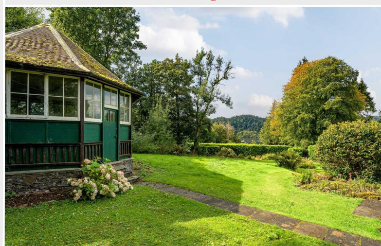
Communal garden and bandstand