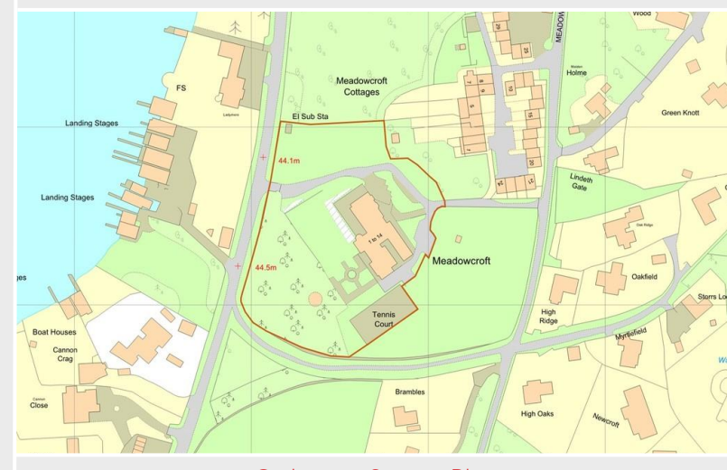
Ordnance Survey Plan