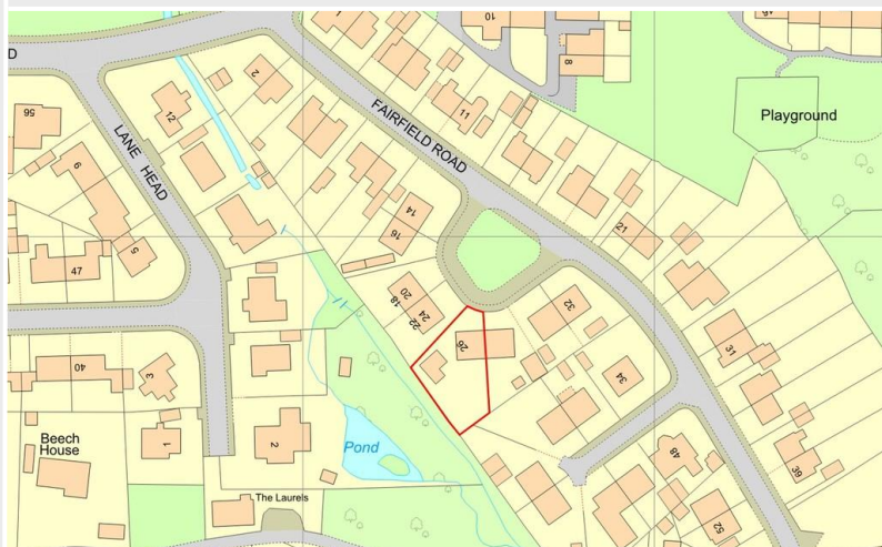
Ordnance Survey Ref: 01168635