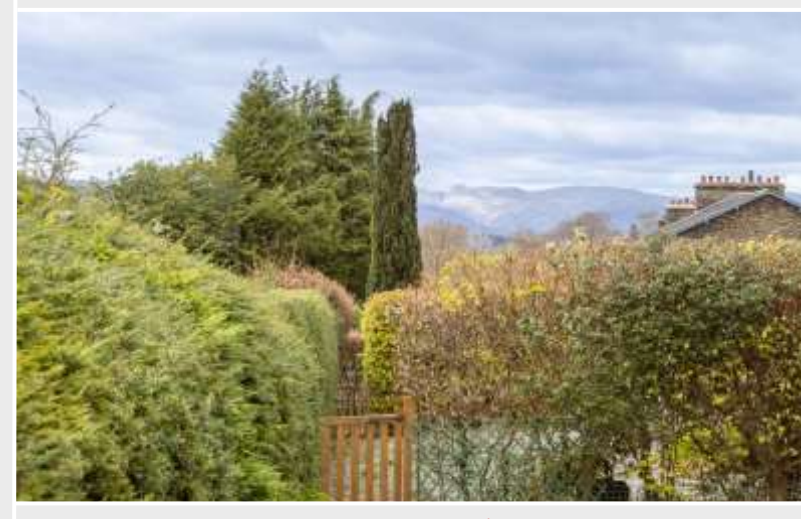
View from garden