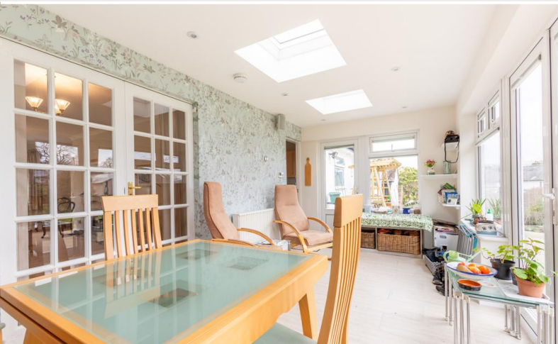
Conservatory Style Dining room