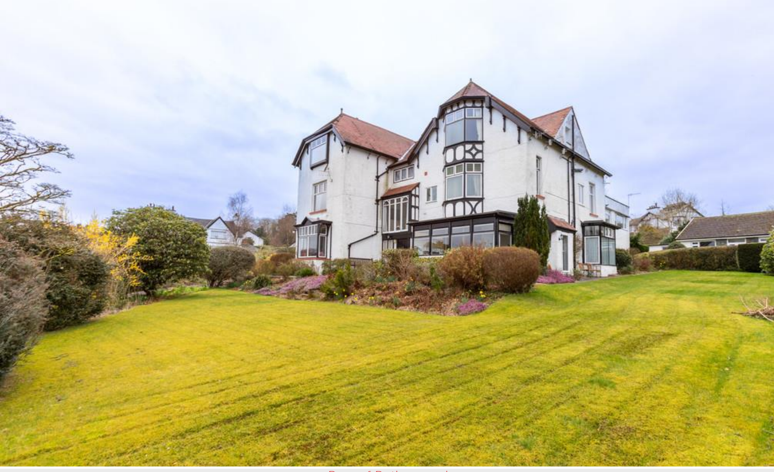
Rear of Rotherwood