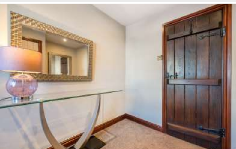
Bedroom 2/Dressing Room

Location: Located towards the top of Troutbeck village roughly halfway between the Queens Head and Mortal Man pubs.