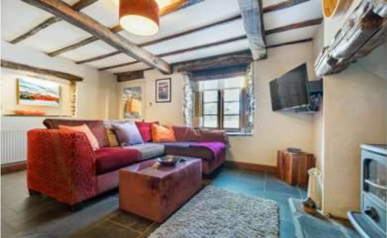
Open Plan Living Room