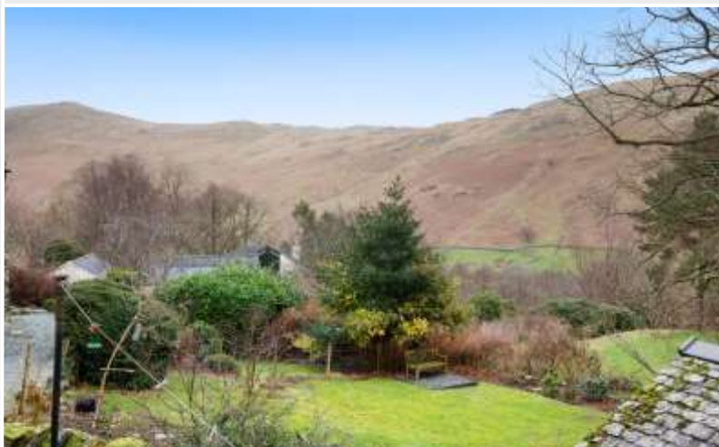
View from the