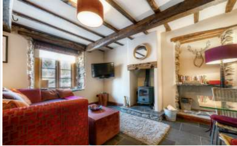
Open Plan Living Room

NB: The sister property The Cosy Peacock is also for sale for £685,000. Further details on request.