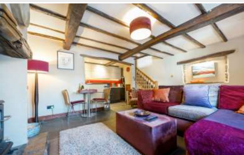
Open Plan Living Room