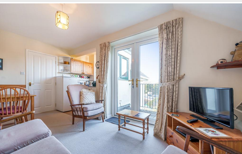
Open Plan Living Room