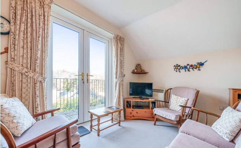
Open Plan Living Room