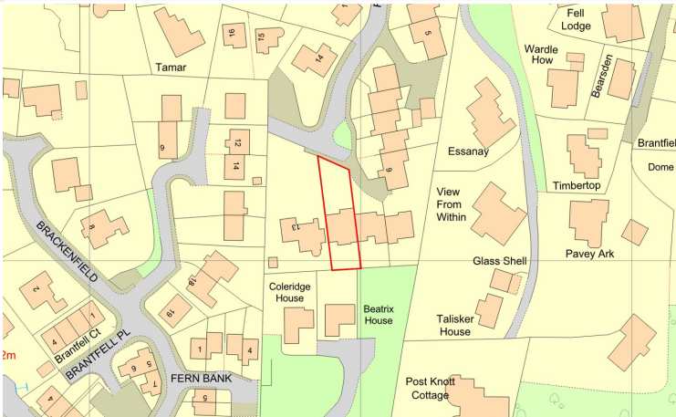
Ordnance Survey Plan