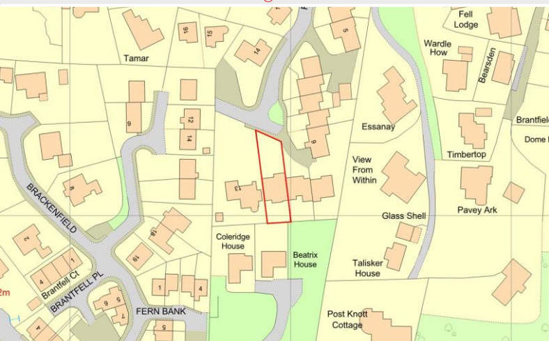
Ordnance Survey Plan