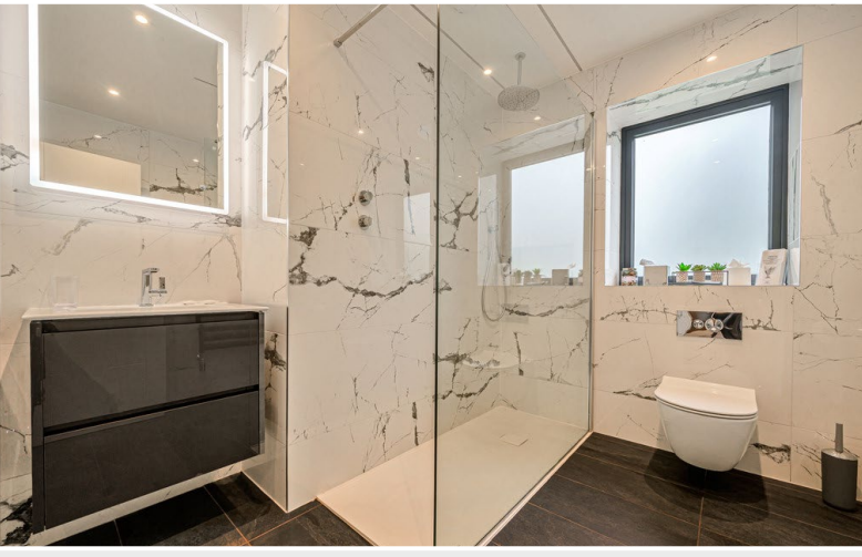
House Shower Room

the dormer windows in this master bedroom - panoramic scenes of the most beautiful Lake District landscape! Cleverly reconfigured this room offers a seating area, open wardrobe and en-suite shower room.