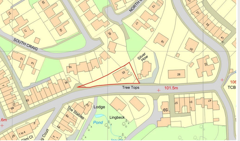
Ordnance Survey Ref: M4P-01130601