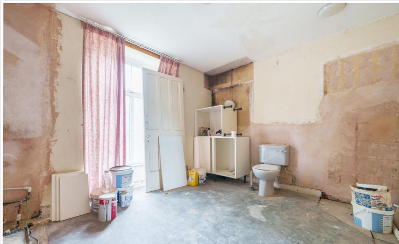
Flat 2 - Proposed En-Suite Bedroom