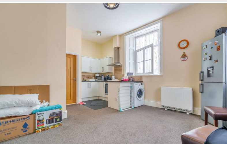
Rafters Flat - Open Plan Living Room/Kitchen