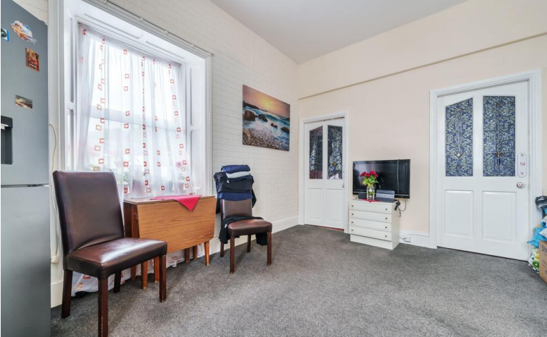
Rafters Flat - Open Plan Living Room