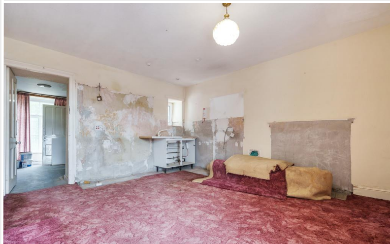
Flat 2 - Proposed Living Room/Kitchen Diner