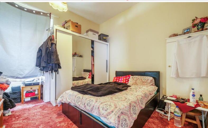
Rafters Flat - Bedroom 1