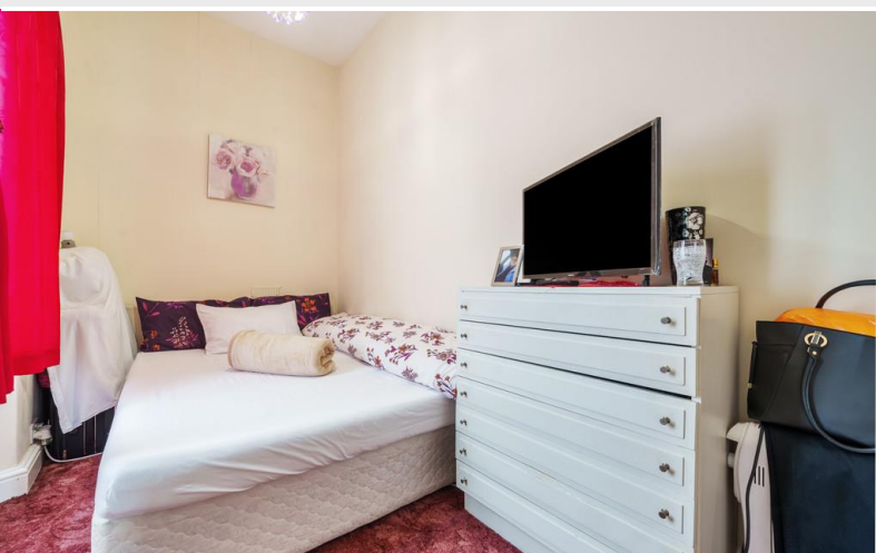
Rafters Flat - Bedroom 2