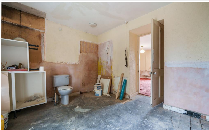
Flat 2 - Proposed En-Suite Bedroom