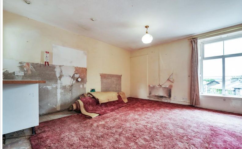
Flat 2 - Proposed Living Room/Kitchen Diner

Anti-Money Laundering Regulations: Please note that when an offer is accepted on a property, we must follow government legislation and carry out identification checks on all buyers under the Anti-Money Laundering Regulations (AML). We use a specialist third-party company to carry out these checks at a charge of £42.67 (inc. VAT) per individual or £36.19 (incl. vat) per individual, if more than one person is involved in the purchase (provided all individuals pay in one transaction). The charge is non-refundable, and you will be unable to proceed with the purchase of the property until these checks have been completed. In the event the property is being purchased in the name of a company, the charge will be £120 (incl. vat).