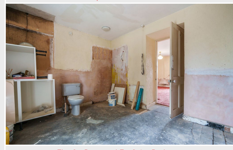
Flat 2 - Proposed En-Suite Bedroom