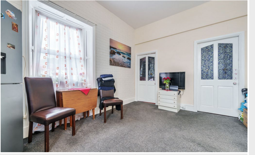
Rafters Flat - Open Plan Living Room