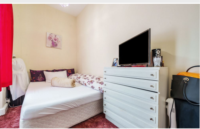
Rafters Flat - Bedroom 2