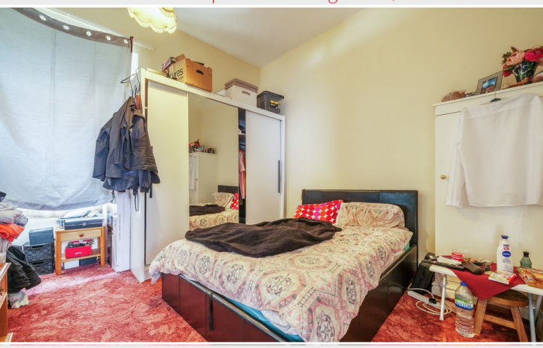
Rafters Flat - Bedroom 1