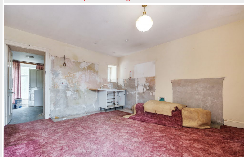
Flat 2 - Proposed Living Room/Kitchen Diner