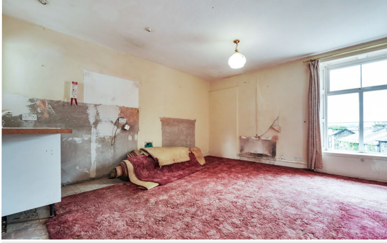
Flat 2 - Proposed Living Room/Kitchen Diner