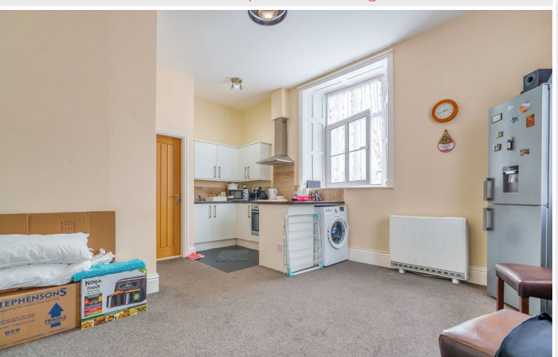
Rafters Flat - Open Plan Living Room/Kitchen