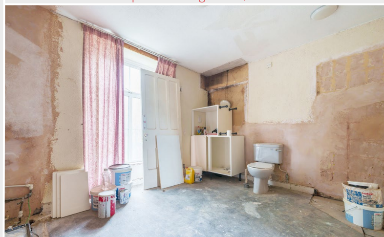
Flat 2 - Proposed En-Suite Bedroom