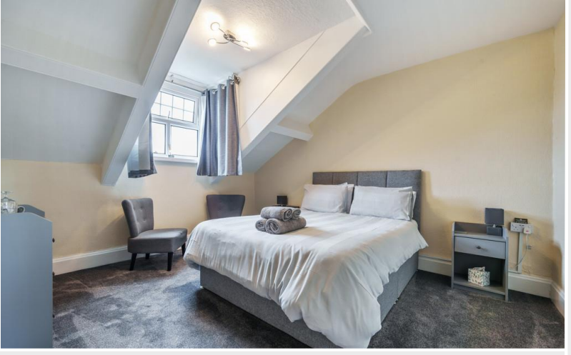
Letting Bedroom 6