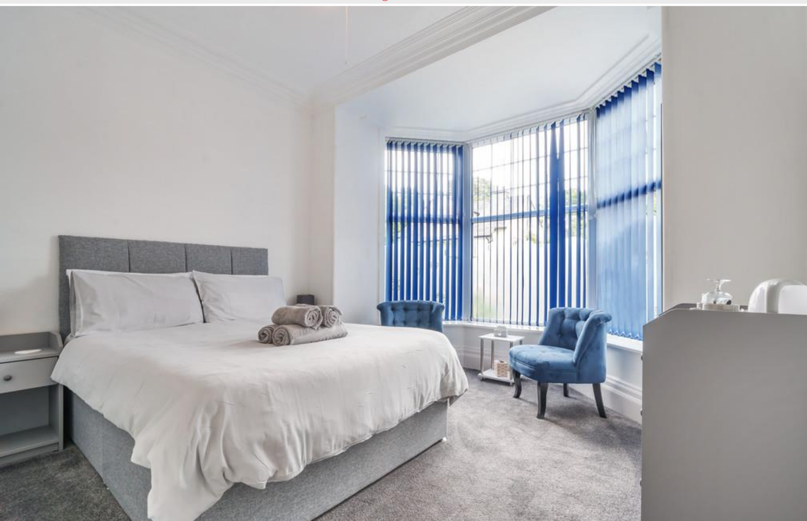
Letting Bedroom 2