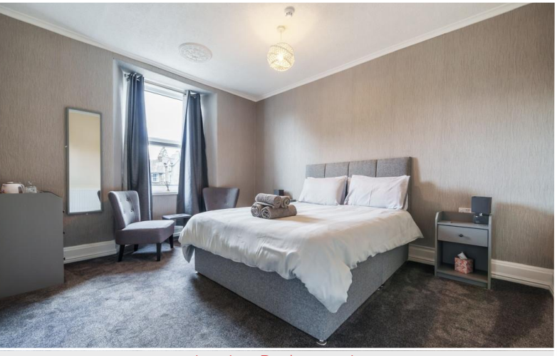
Letting Bedroom 4