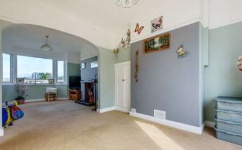
Open Plan Living Room/Dining Room