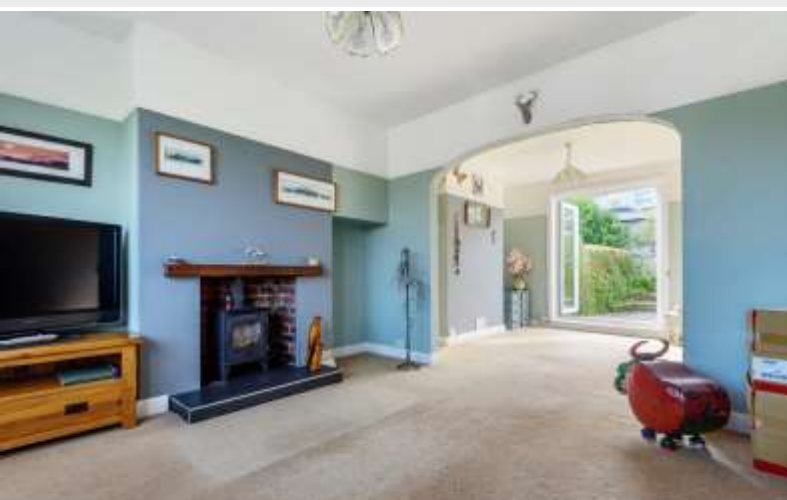
Open Plan Living Room/Dining Room