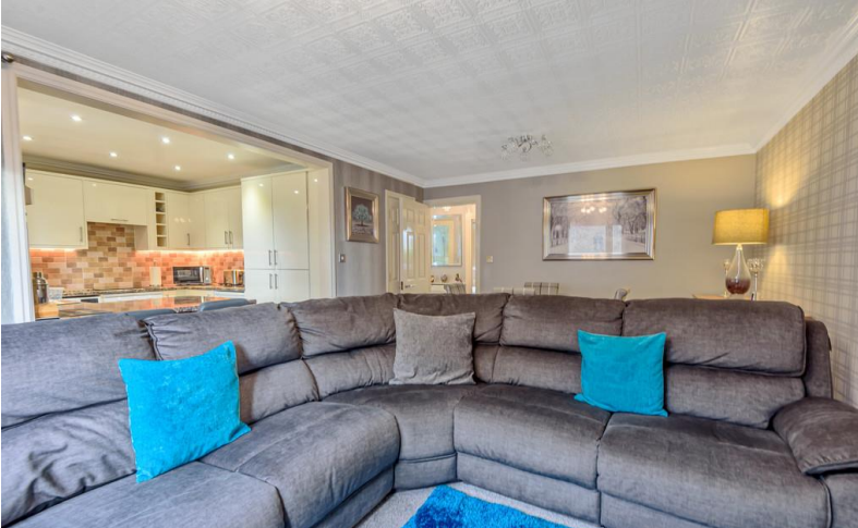
Open Plan Living/Dining Room