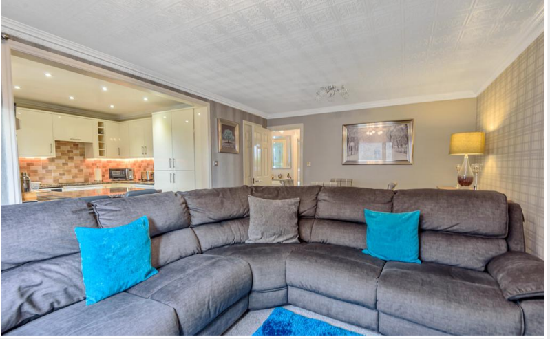
Open Plan Living/Dining Room