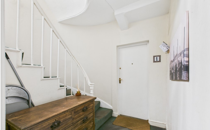
Communal Entrance Hall