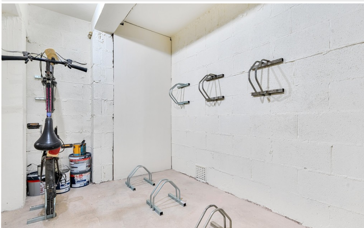
Communal bike store