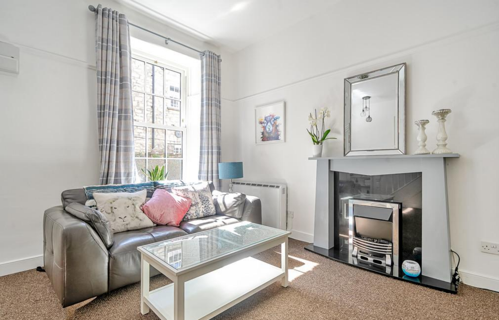
Open plan living room/kitchen