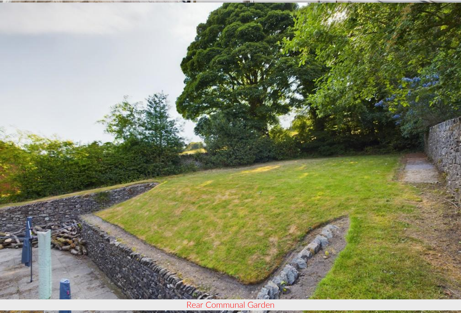
Rear Communal Garden