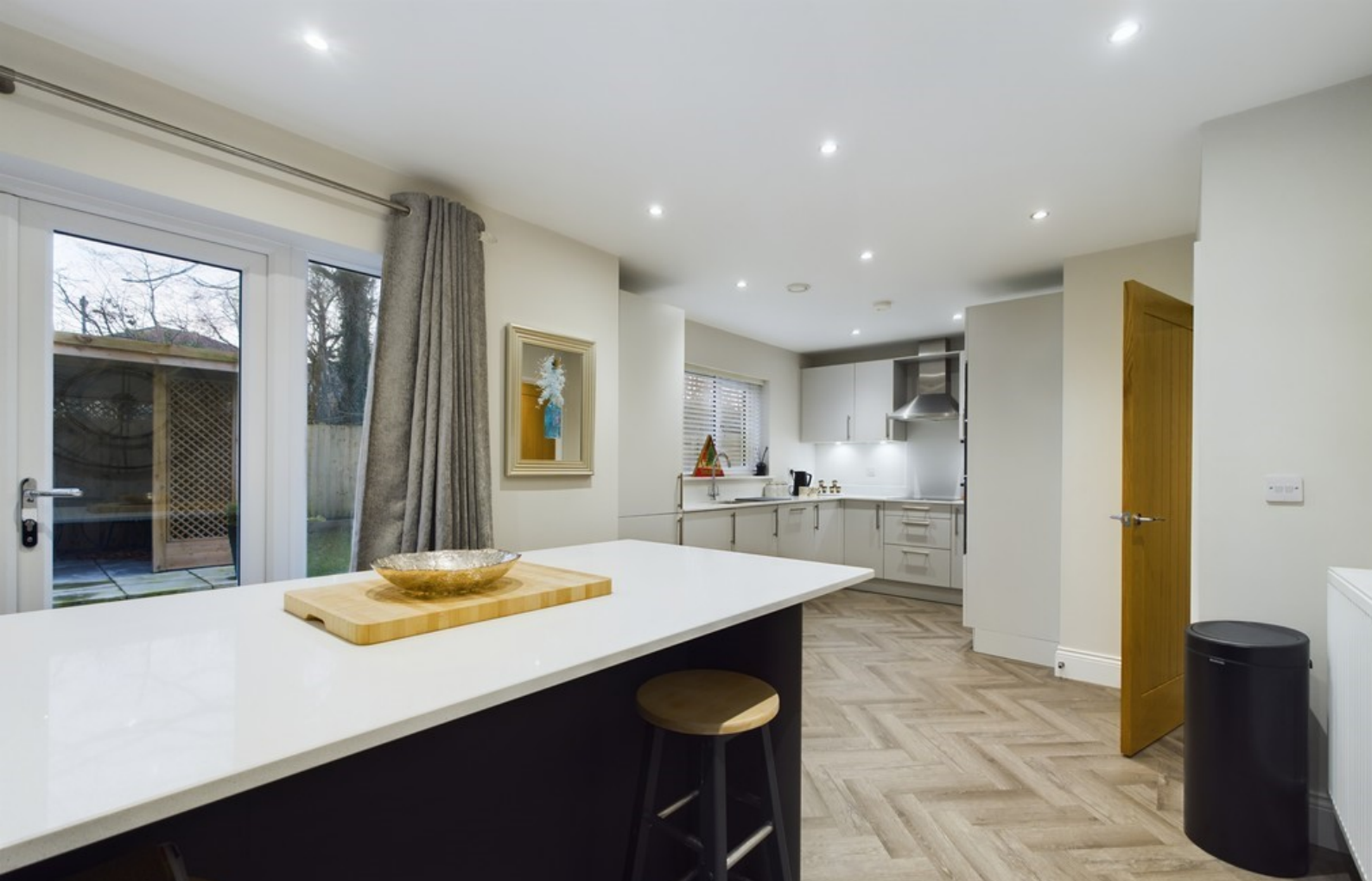
Kitchen Dining Room