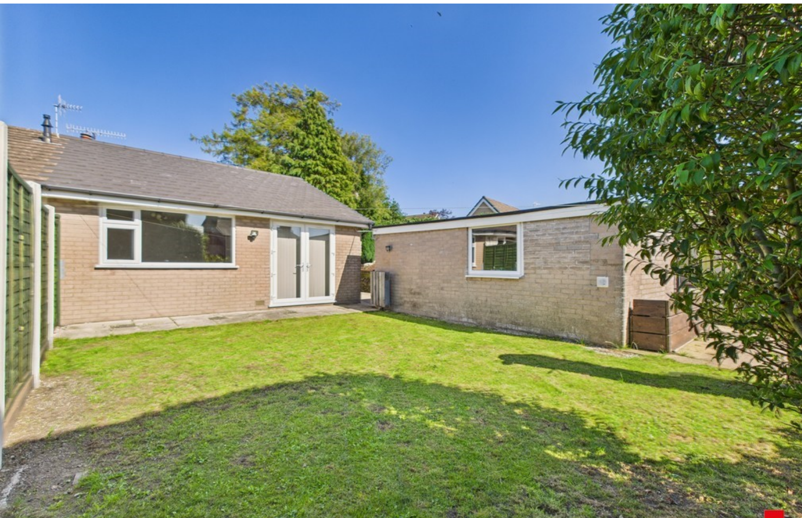
Rear of Property and Garden