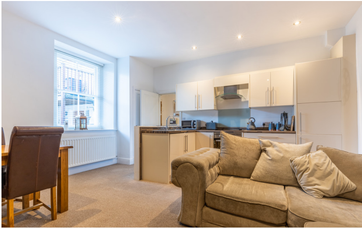
Open plan Kitchen/Living Room