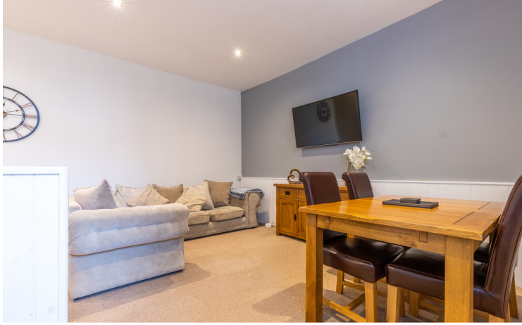
Open plan Living space