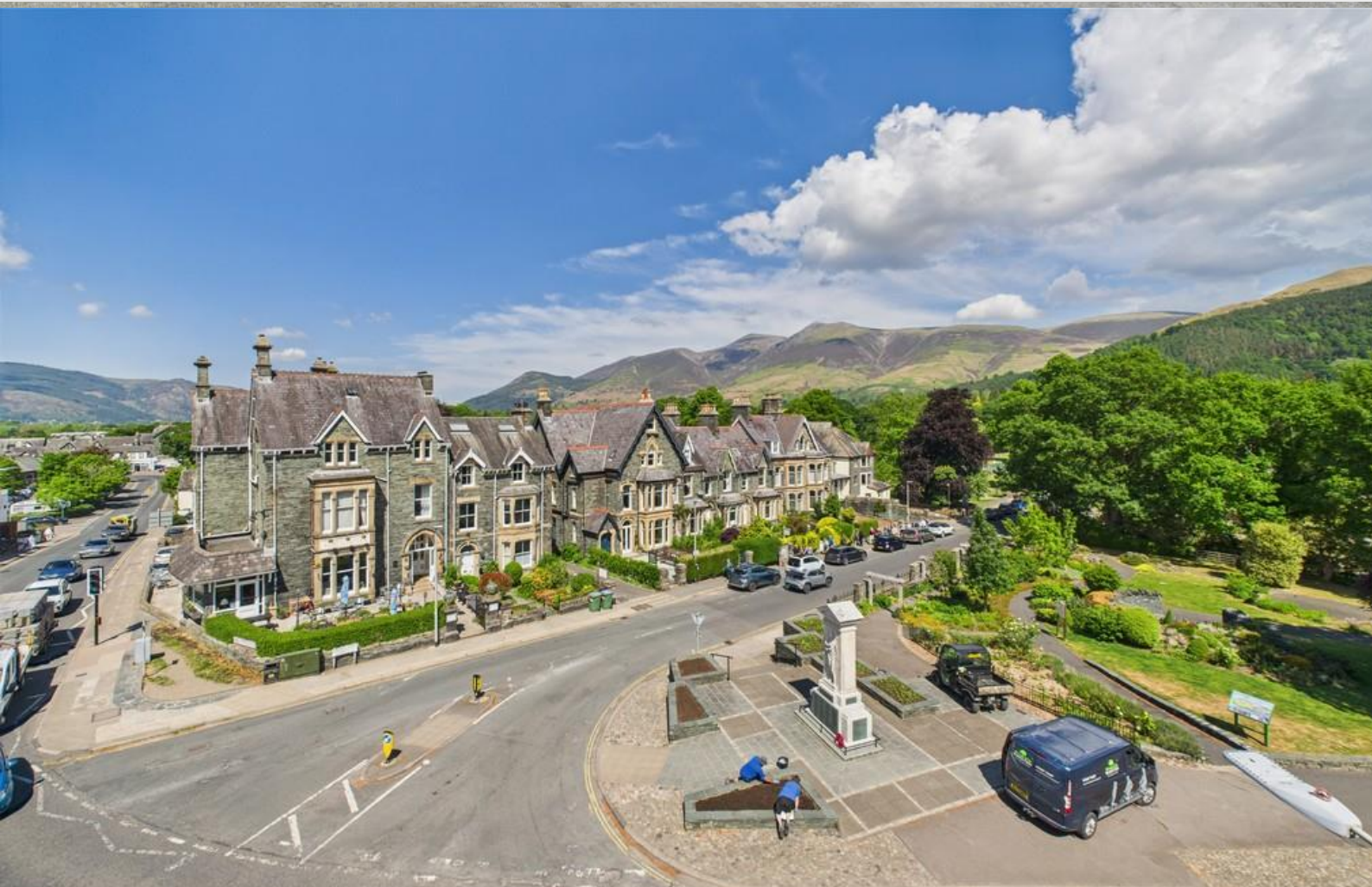
View from lounge