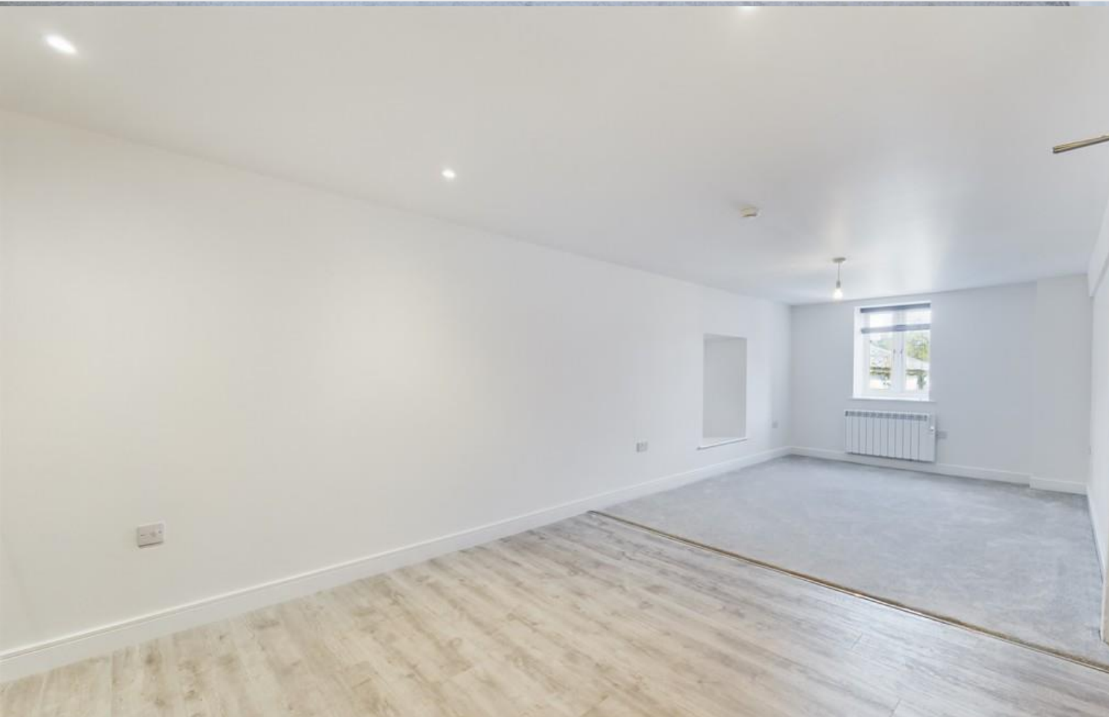
Open Plan Living Dining Area