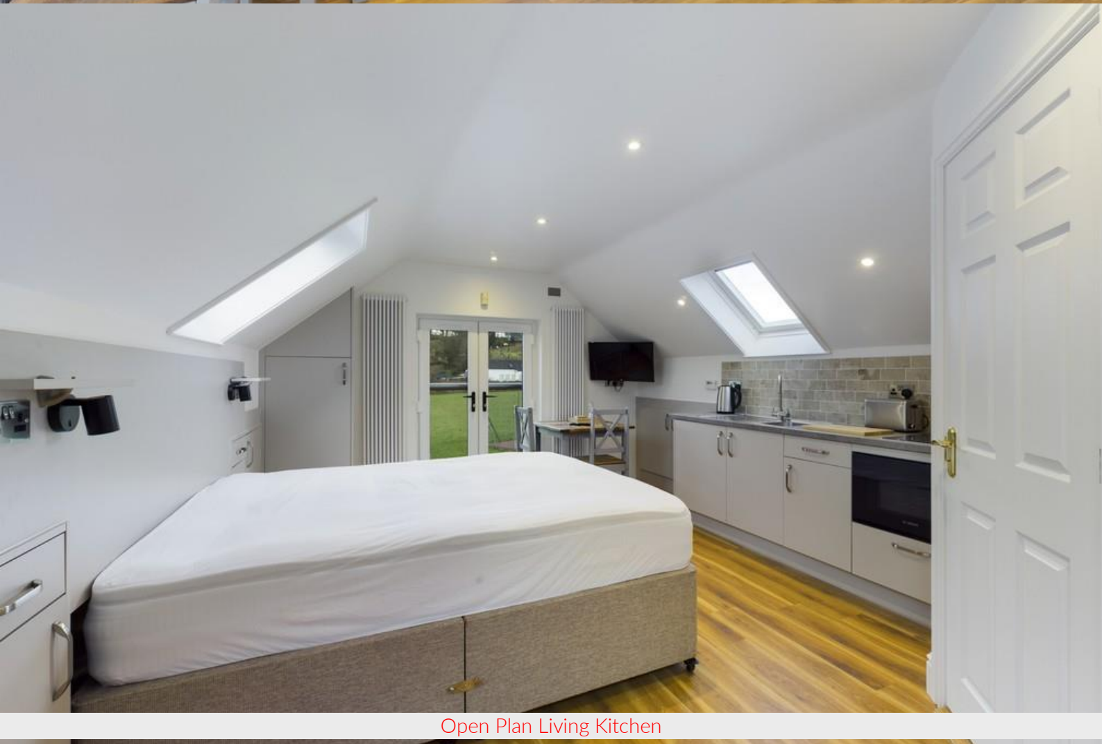
Open Plan Living Kitchen