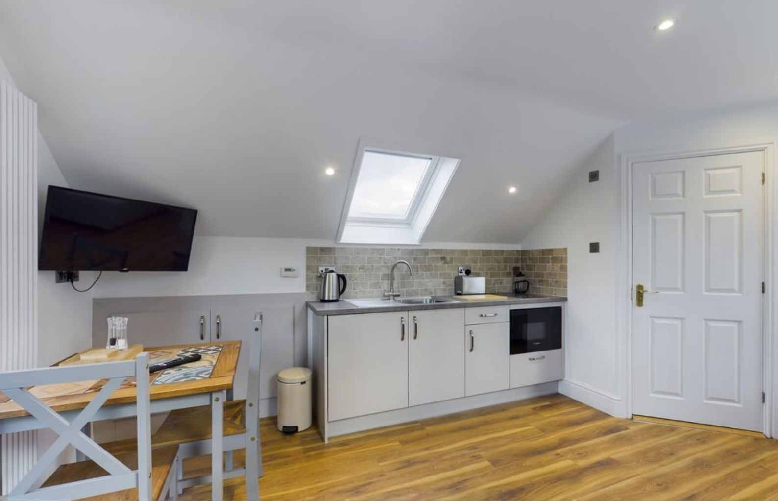
Open Plan Living Kitchen