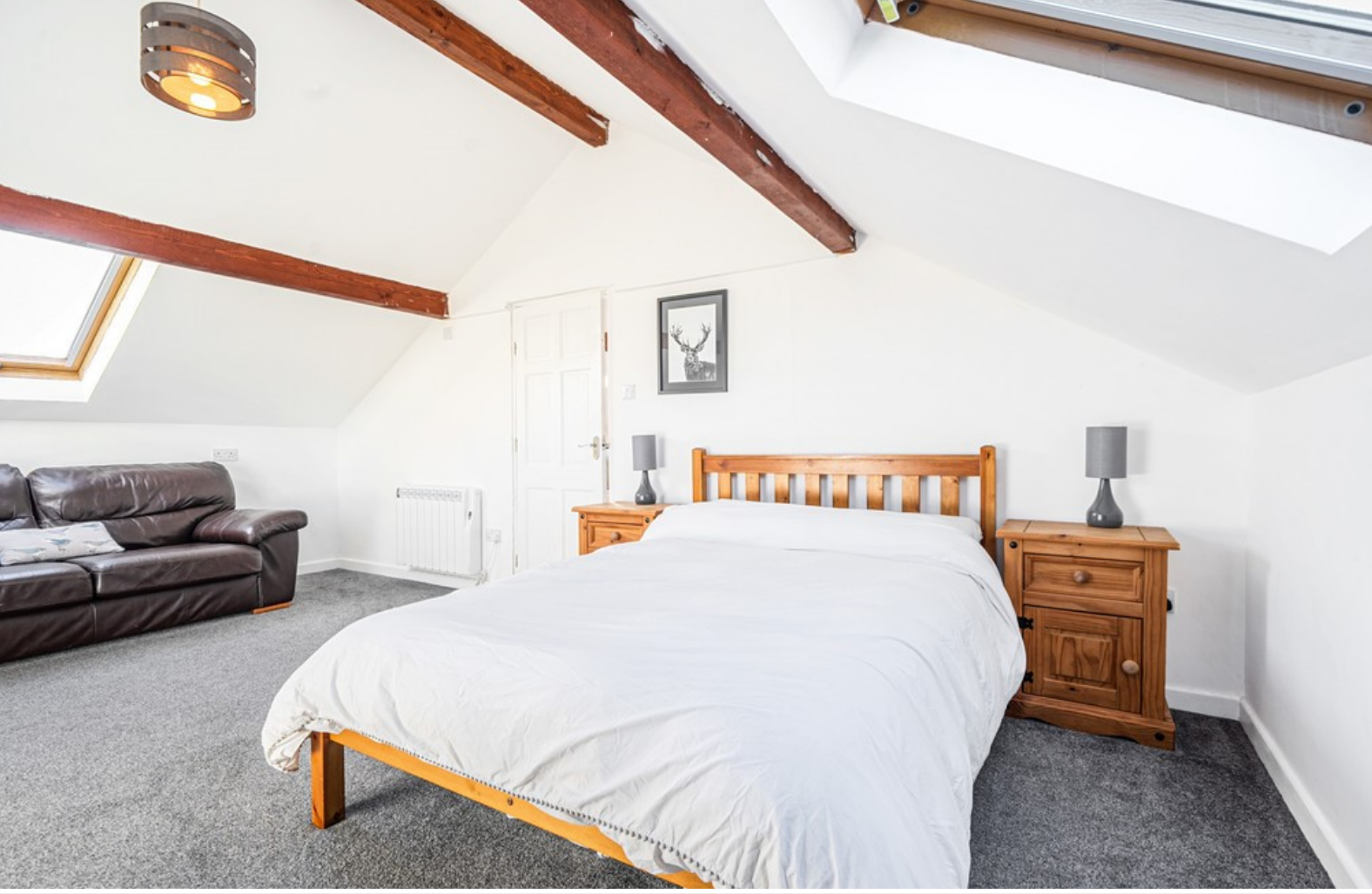
Pinethawaite Studio Bedroom