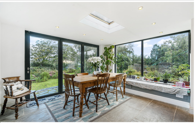
Family Dining kitchen