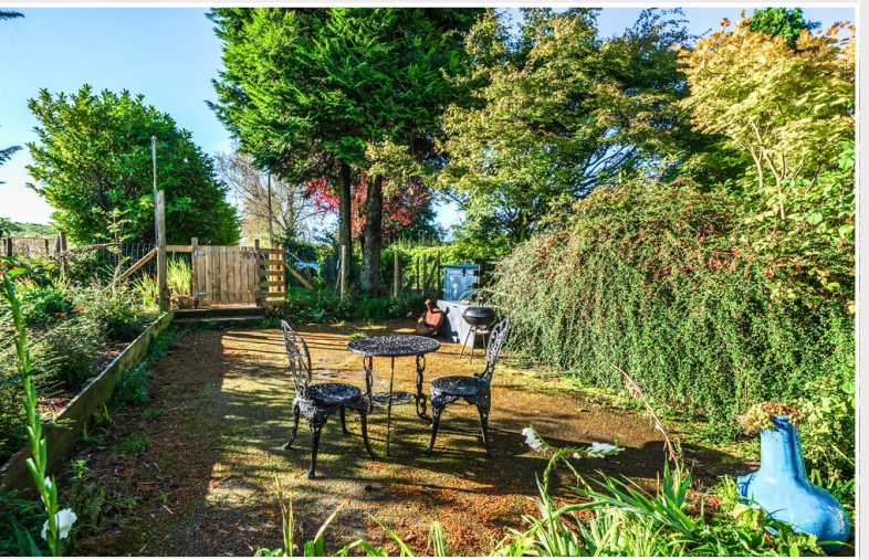
Pinethwaite Studios Garden