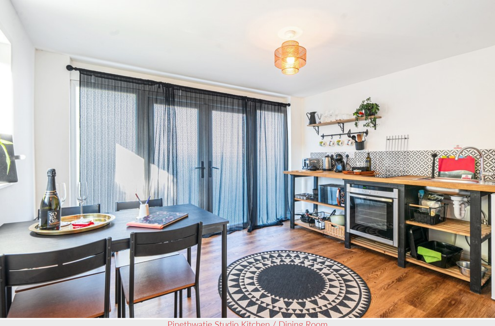
Pinethwatie Studio Kitchen / Dining Room