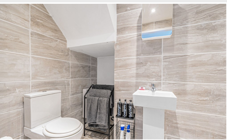
Pinethwaite Studios Shower Room