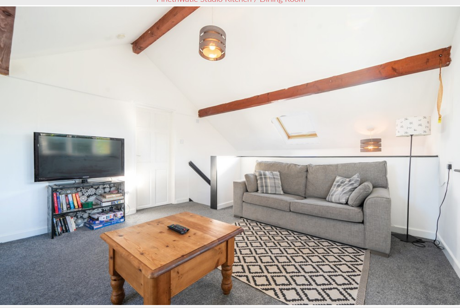
Pinethawaite Studio Lounge