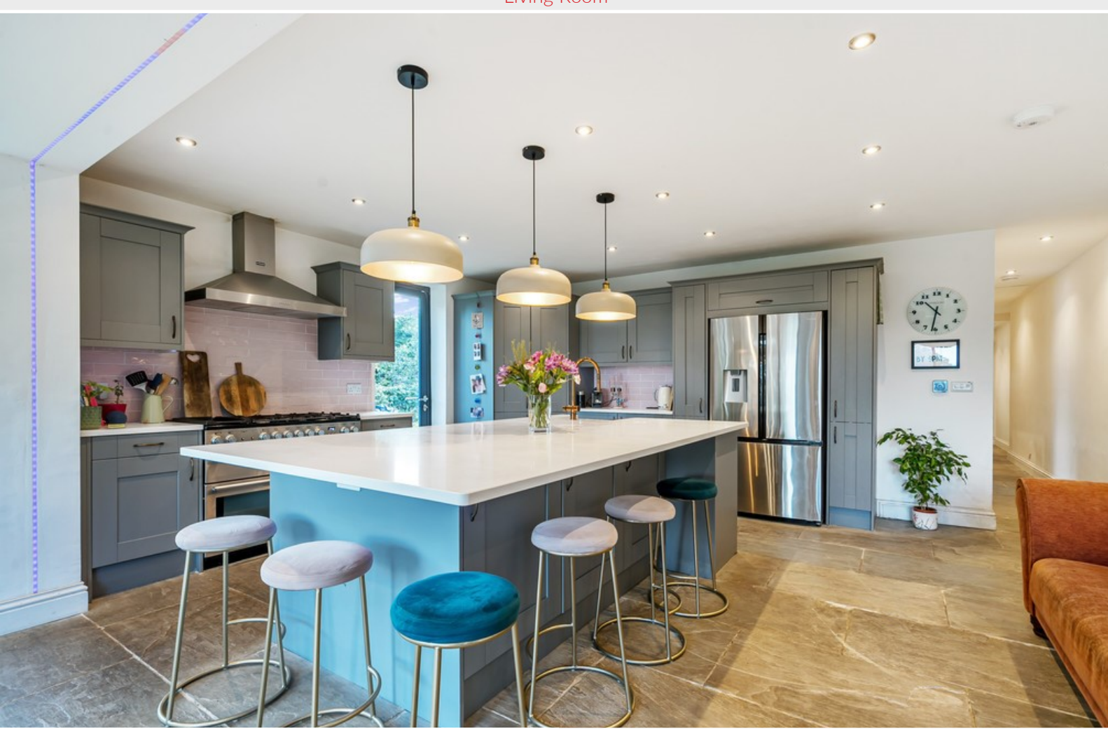
Family Dining Kitchen