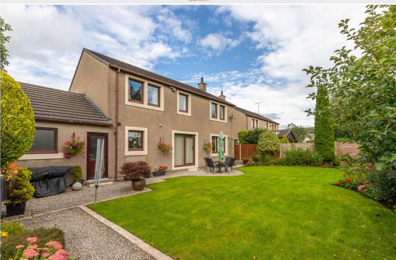
Rear Elevation and Garden