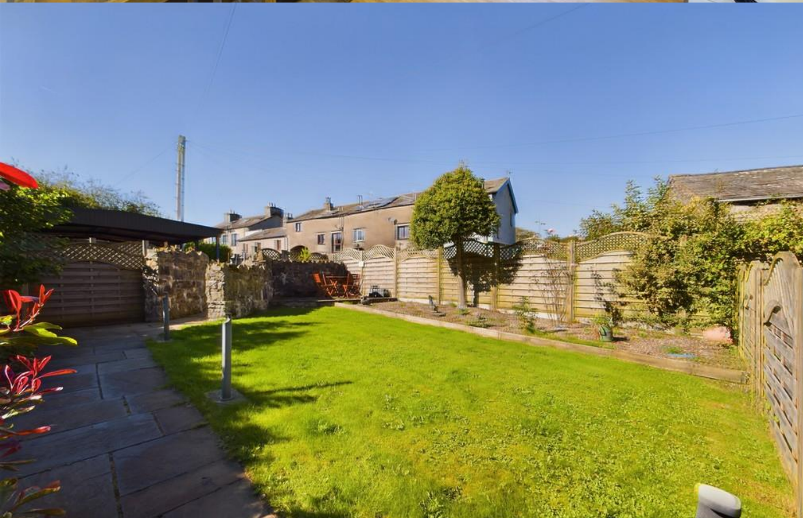
Communal Garden Space