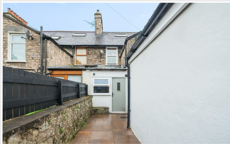
Rear Aspect and Yard