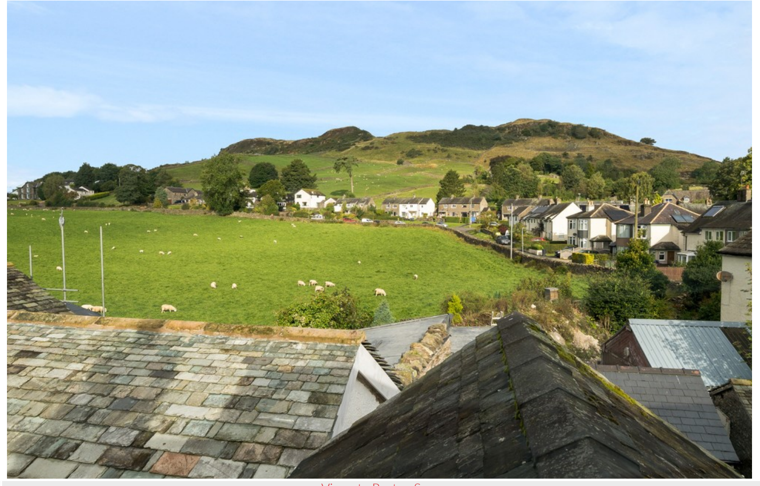
Views to Reston Scar